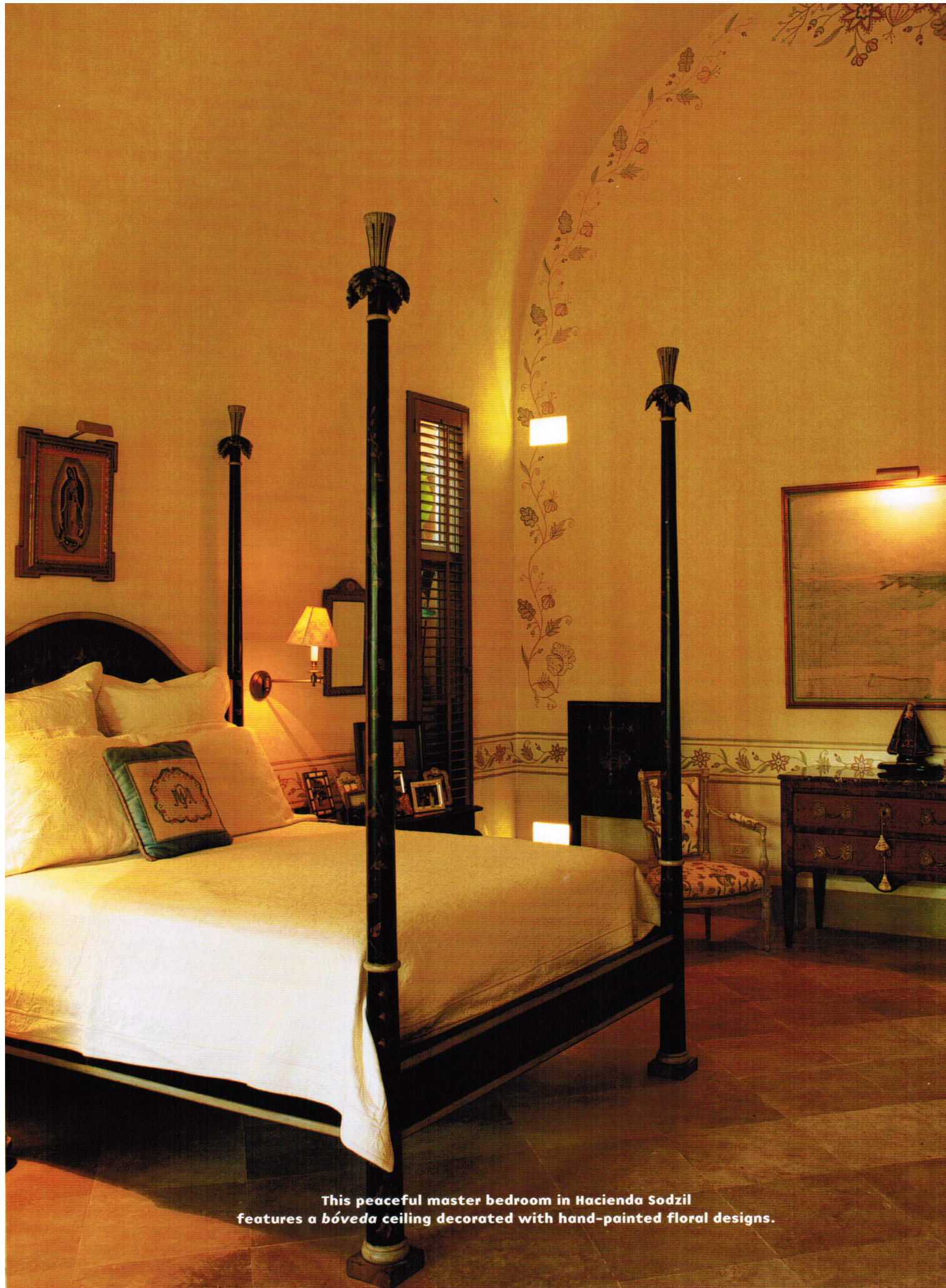
This peaceful master bedroom in Hacienda Sodzil features a bóveda ceiling decorated with hand-painted floral designs.