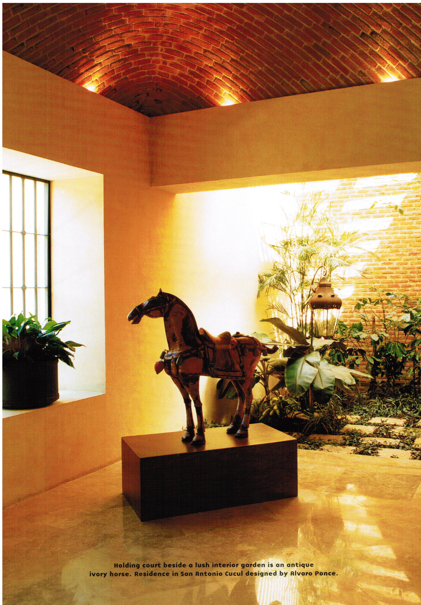
Holding court beside a lush interior garden is an antique ivory horse. Residence in San Antonio Cucul designed by Alvaro Ponce.